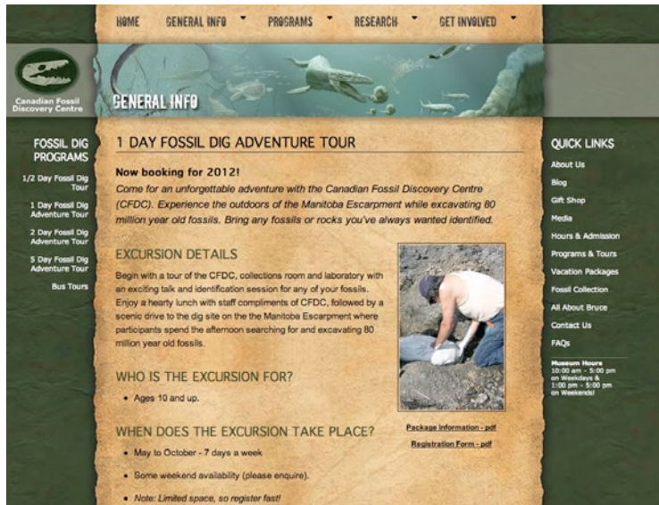
Webpage appearance for Canadian Fossil Discovery Centre experience before EQ exercise