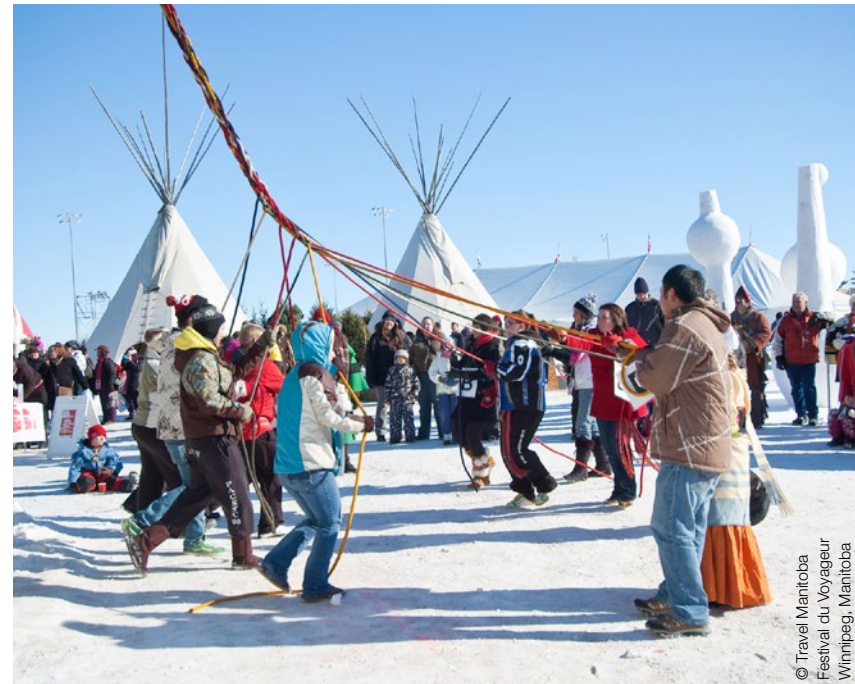
Festival du Voyageur Winnipeg, Manitoba