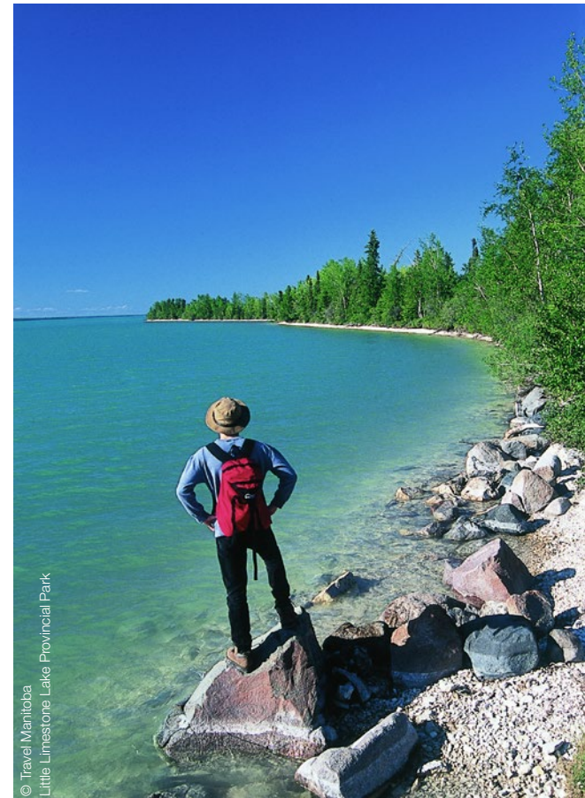
Little Limestone Lake Provincial Park

"We now have the information in our hands to explain why we are going to do some things; we also have the information in our hands to explain why we are not going to do some things."