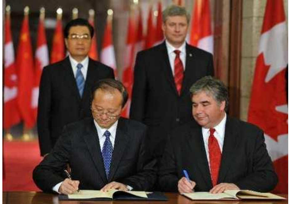
Canada was granted Approved Destination Status in 2010.