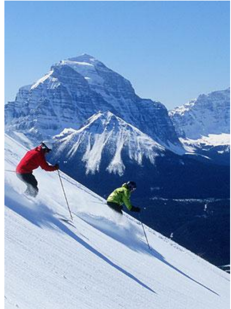
Skiers near Lake Louise.