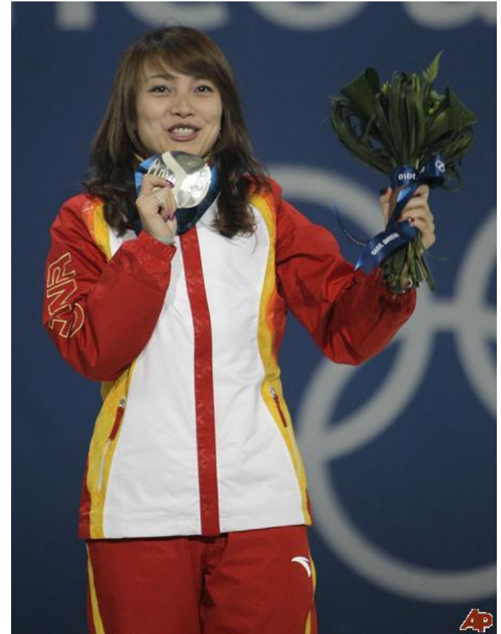
China's Nina Li won a Silver Medal in Women's Aerials at the 2010 Winter Olympics in Vancouver.