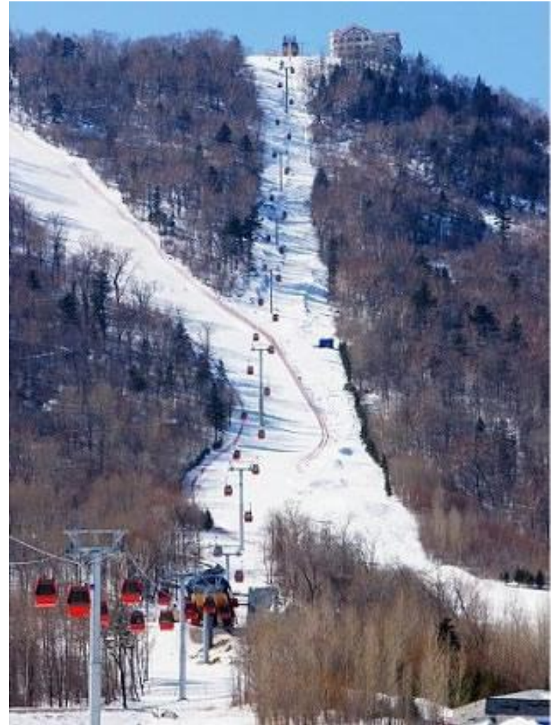
A chair lift at newly-renovated Yabuli Sun Mountain.