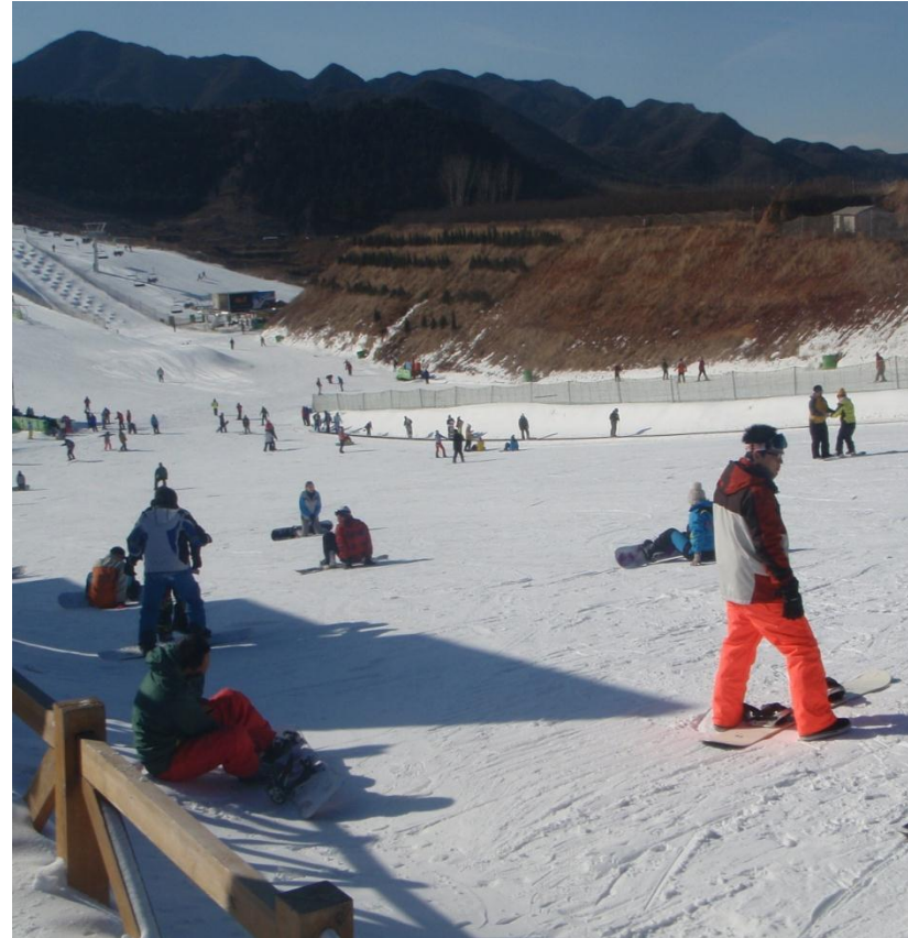
Skiers at Beijing Nanshan.