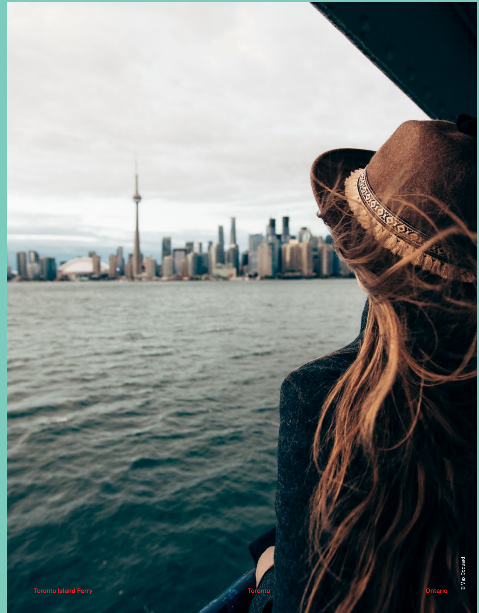
Toronto Island Ferry

As the industry recovers, there will be a lag in the return of funding to these organizations, which may require a reordering of priorities and responsibilities.