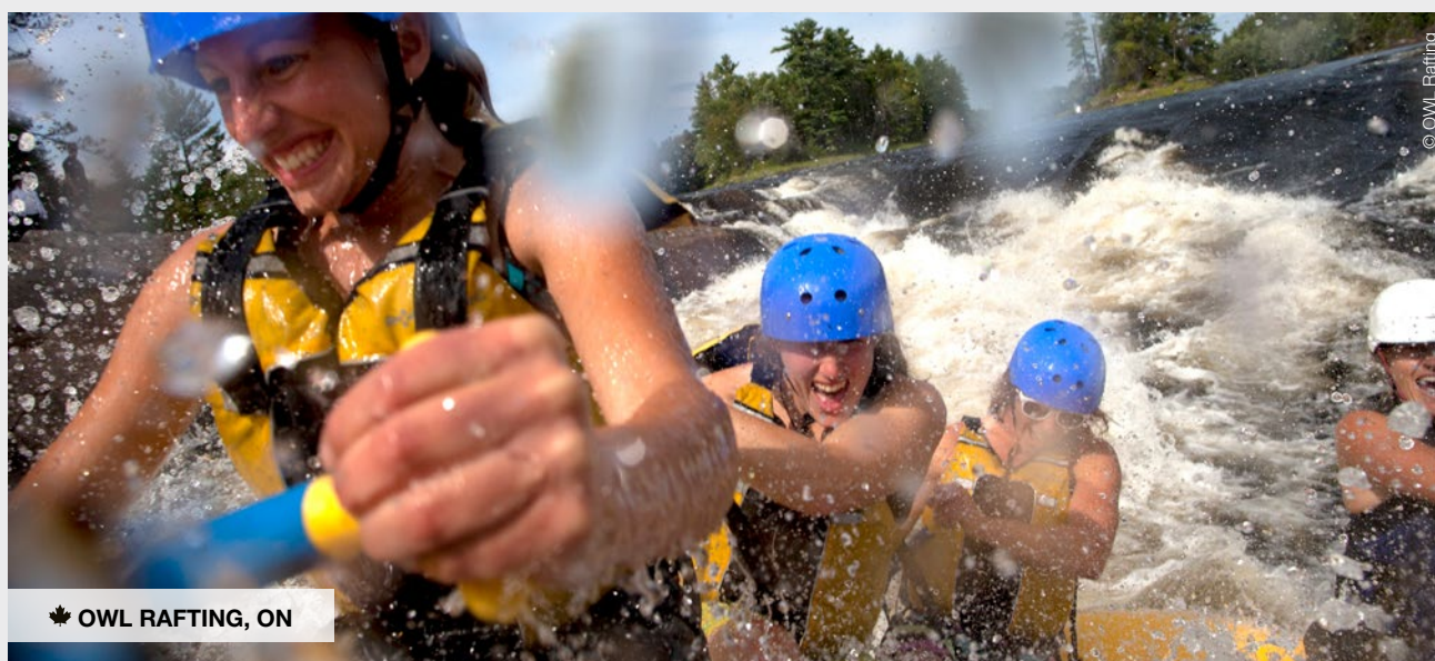
🍁 OWL RAFTING, ON