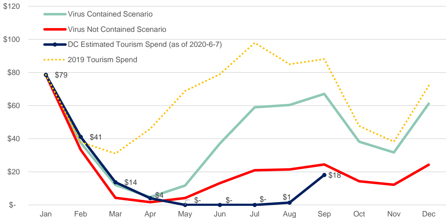
Source: Destination Canada Estimates, Tourism Economics Estimates

As Australian travellers generally book their travel to Canada up to four months in advance, we do not currently have enough data to assess the impacts past September 2020.